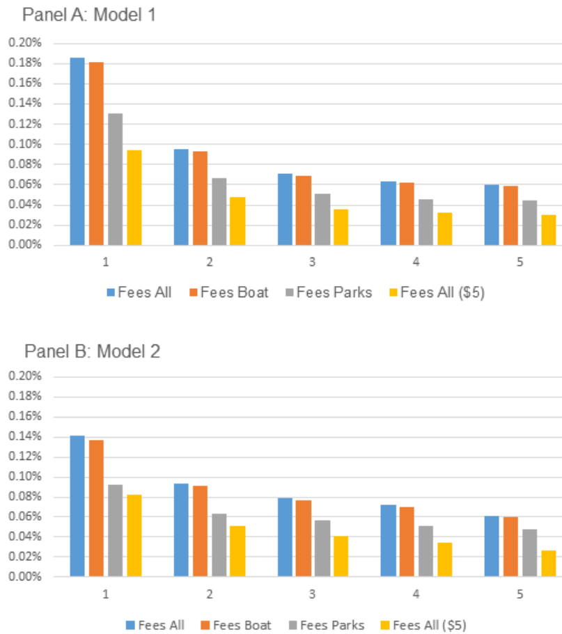
Figure B2: Income Share of Fee Paid by Each Income Group in Four Scenarios