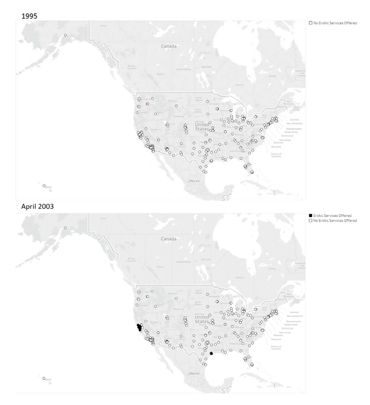
Figure A.3 Top panel is 1995. Bottom panel is April 2003.